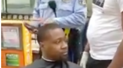
Police try to shut down a man giving home: people haircuts in viral video