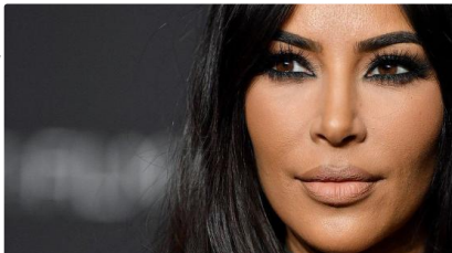
What's Going on with Kim Kardashian's Basi Less Sinks?