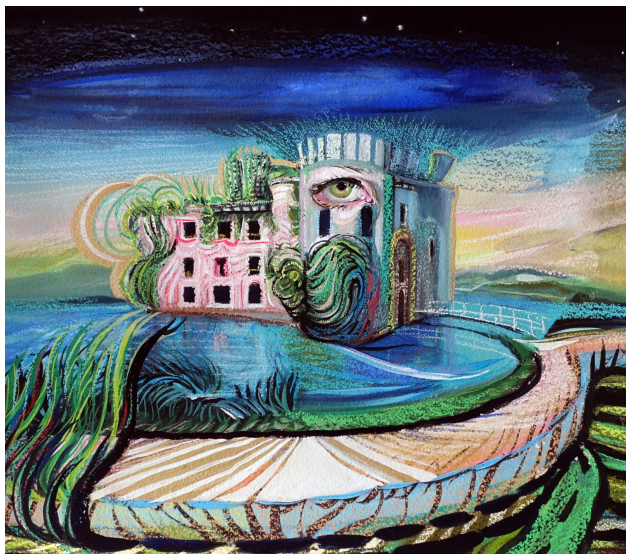
1/7 Natalie Frank, Drawing for Grimm Tales - The Frog King, 2018

READ FULL SERIES ( HTTPS://WWW.PAPERCITYMAG.COM/SEC )