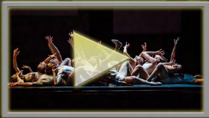
Ballet Austin's Official LIGHT TRAILER