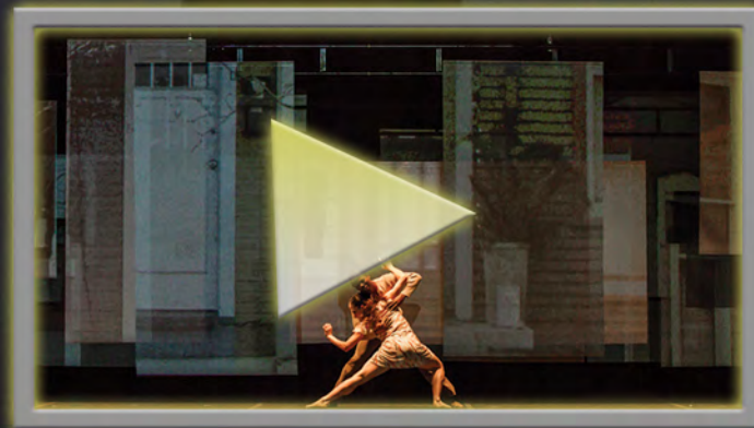
United Nations RADIO INTERVIEW