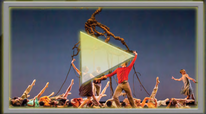
U.S. Holocaust Museum PODCAST INTERVIEW