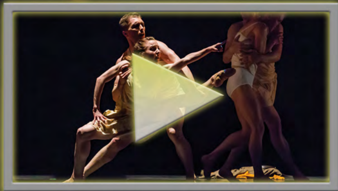
TEDx TALK YOUTUBE PODCAST