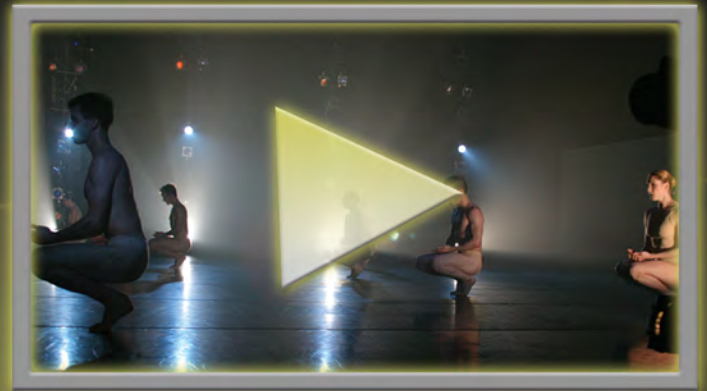
Emmy-Winning Documentary PRODUCING LIGHT